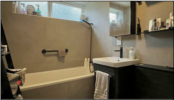
Trident Close, Sutton Coldfield, B76 1LF